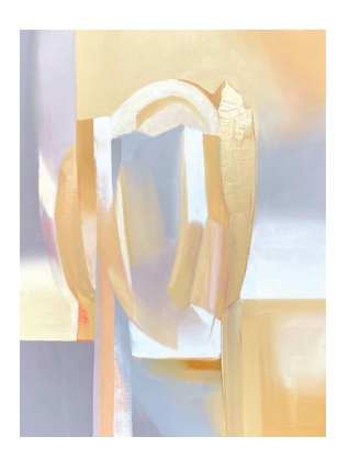
ORIGINAL ARTWORK BY ZOË PAWLAK, PLUS AN INTIMATE STUDIO TOUR FOR SIX

Original Art: Everything Forgiven Glows Oil on Canvas, 30" x 40" H